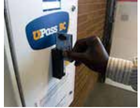
U-Pass Dispensing machine